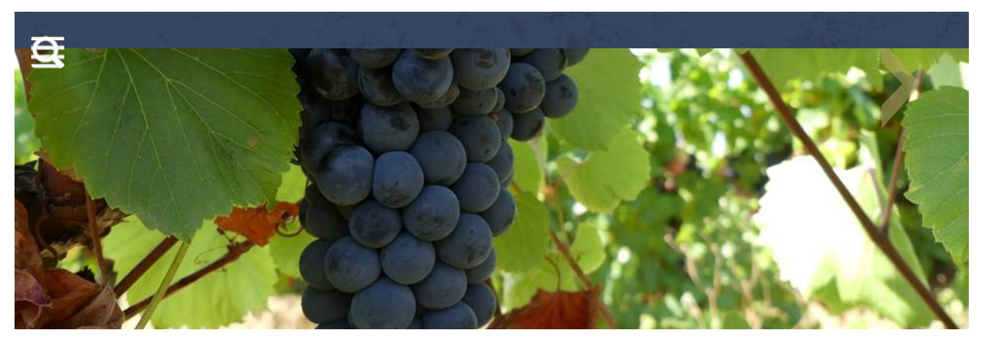
Home / Our producers / Quinta da Alorna, Portugal