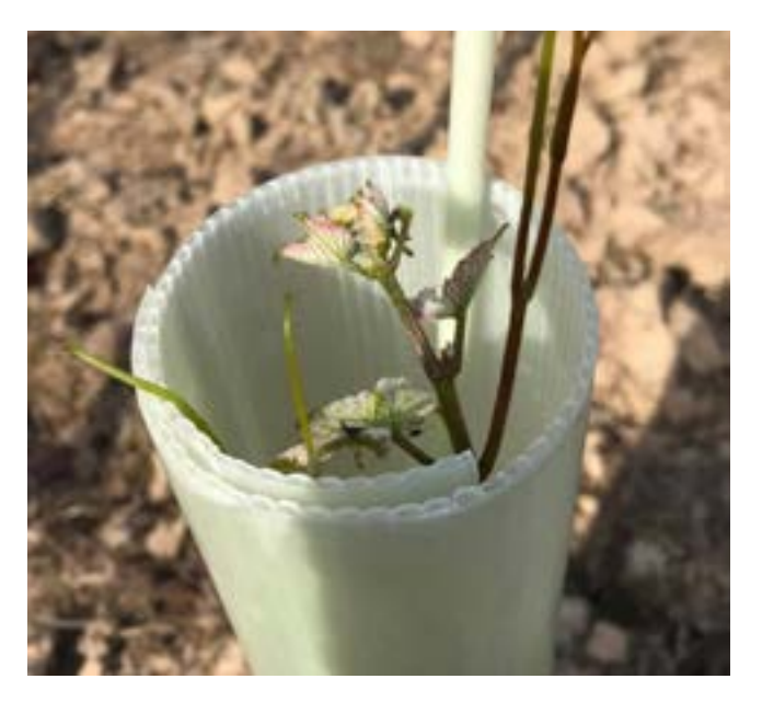
Young vine during the spring frost, Hidden Spring Vineyard, East Sussex

Despite this, the growing consensus on English wine, especially of that coming out of the south east, is that we are witnessing riper, more concentrated, less astringent grapes that allow for more flexibility on styles and grape varieties that are planted. We can expect table wines to become more available, made from not only Bacchus, but high quality Pinot Noir and Chardonnay