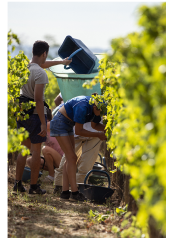
Working hard. Château de Ferrand

2022 was the opposite of 2021. The conditions were extremely dry, with lack of water a major issue, fortunately, Ferrand's vineyard wasn't impacted by the hydric stress due to our terroir, as the vine took advantage of the moisture from the limestone soils to feed the berries. After 2021, we were expecting a challenging year but thanks to our terroir and our team, the result is