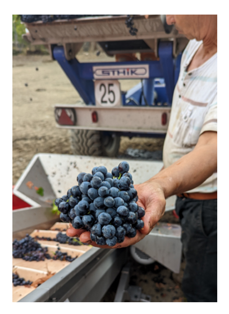
Pristine fruit, Terres Fidèles

Overall the results of the vintage are really excellent. The vines produce outstanding fruit, the 2022 vintage looks like it will be very sexy, with round, soft tannins, with loads of delicious, ripe fruit aromas". Kelly Gonnet