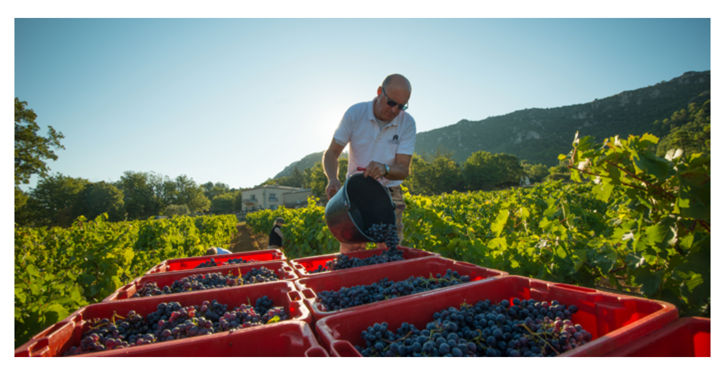
Red harvest at Château d'Escarelle

With this new vintage, we are also experimenting with vinification in oak. A small part (12% of the final blend) of our high-end cuvée 'Croix d'Engardin' has been fermented and aged in new French oak 400 litres barrels on lees with frequent 'batonage'. An addition of a few 'filtrats' (bourbes/solids that have been carefully selected and filtered) provide intensity, concentration of fruit and balance".